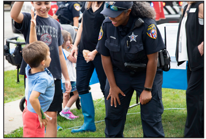
The Wheaton Police Department will host National Night Out on Aug. 6 at Northside Park.

Tune into 'A Talk in the Park', a new podcast created by the Wheaton Park District. Learn about Wheaton events, unique programs, conservation efforts, behind the scenes and more in this new, local series. Episodes will air the second Tuesday of each month beginning in July. Download and subscribe to 'A Talk in the Park' on iTunes or Android. For more information visit wheatonparkdistrict.com .