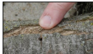
This emerald ash borer was spotted on a Wheaton tree (top). Woodpecker damage is one of the signs of infestation.