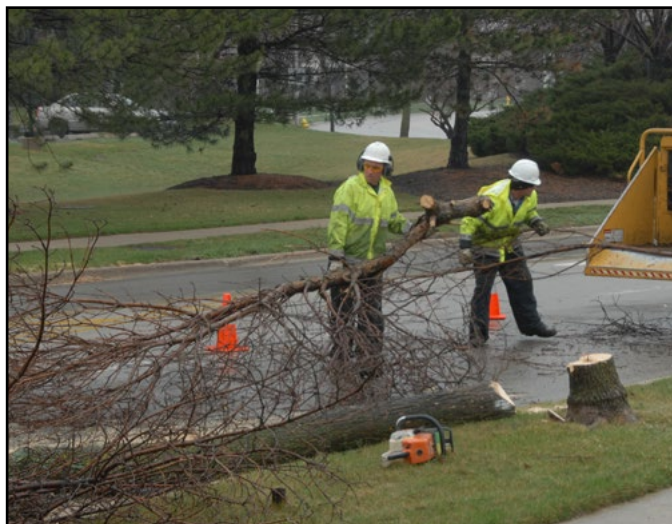
Crews removed infested trees in the parkway along East Loop Road. A grant assisted the City in removing and replacing these ash trees with four different types of trees.

A federal grant administered by the Metropolitan Mayors Caucus for nearly