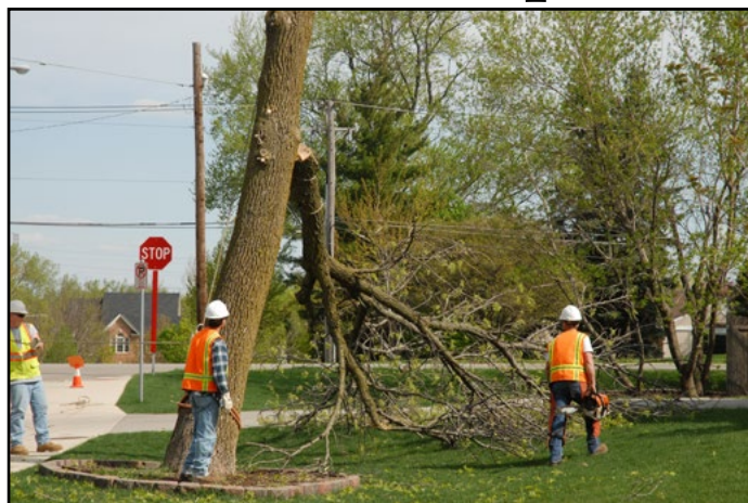
Due to widespread emerald ash borer infestation throughout Wheaton, crews will continue removing parkway ash trees.