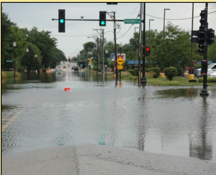
This project will help reduce flooding on North Main Street between Cole and Parkway.

T he southbound lane of North Main Street between Cole and Parkway is now closed, and it will remain closed through late October. This closure is related to work to help reduce flooding in this area, referred to as the North Main Street Flood Control Project.