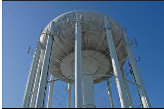
The Orchard Water Tower on Marywood Trail will be repainted this month.

The contractor will typically be working Monday through Friday between the hours of 7 a.m. and 5 p.m. There could be times when work may extend into the early evening hours. Depending on delays or weather conditions, some work