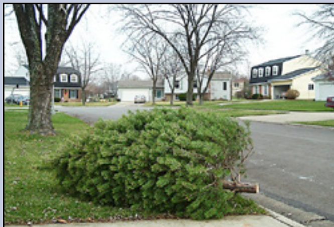
The City's waste hauler will collect Christmas trees for recycling Jan. 6-17 on your garbage day.