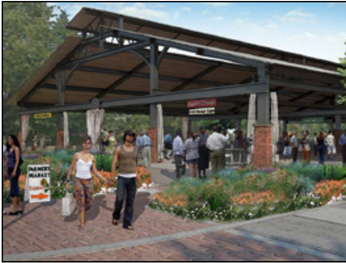
The ideas suggested in the Downtown Plan include creating a more permanent structure for the French Market.