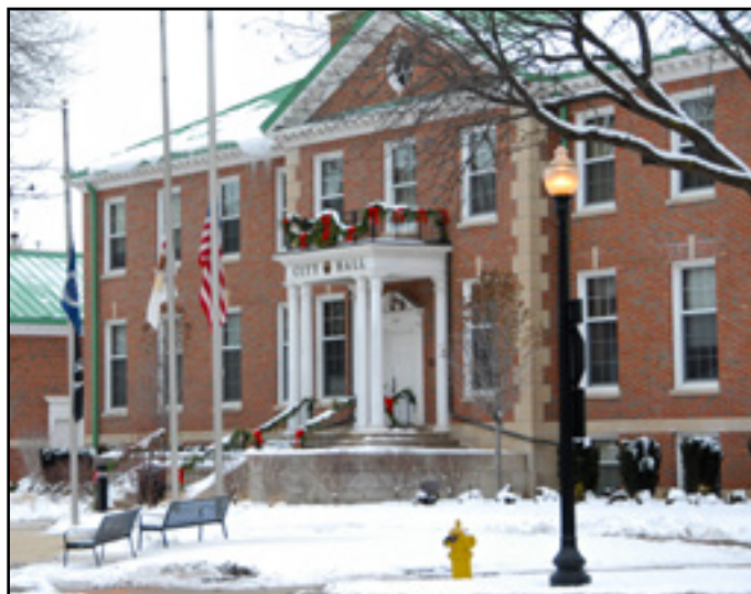
A confidential survey seeking residents' input on a variety of topics and City services will be mailed out in coming weeks.

The City has contracted with the ETC Institute to conduct a survey of randomly chosen households. The statistically valid survey covers a broad range of topics and City services, ranging from public safety, infrastruc-