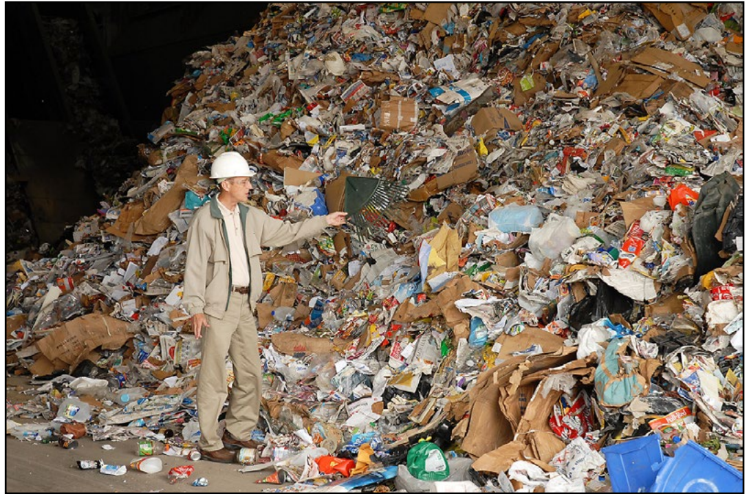
Your garbage day, procedures for placing garbage and recycling at the curb, and stickers remain the same as before Advanced Disposal Services took over Veolia's waste business.

The City Council voted to extend the current contract with Advanced Disposal (formerly Veolia) for a three-year period. The City previously signed a five-year contract with Veolia beginning July 1, 2008 that was set to expire in June 2013. Advanced Disposal/Veolia offered a three-year contract extension with no sticker price