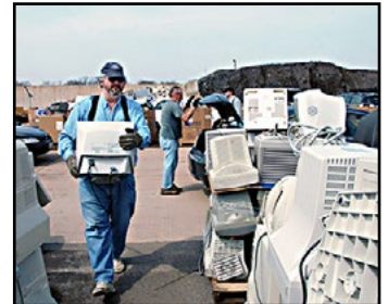
Starting in July, Wheaton residents will be able to place electronics like computers at the curb for pickup for one garbage sticker per item.

Once the contract extension begins in July 2013, Advanced Disposal will begin offering curb side pickup of electronic waste (such as computers and televisions) for one sticker per item. Also, items considered "white goods" – appliances containing hazardous components, such as refrigerators, hot water heaters, microwaves and humidifiers – will only require one sticker per item, instead of three stickers.