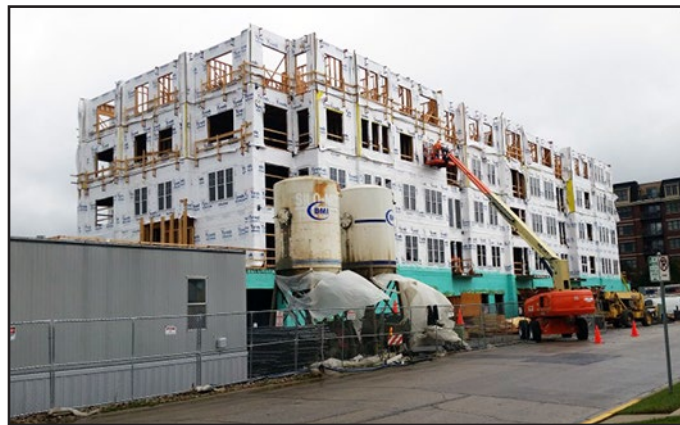
The Courthouse Square development is back on track with construction of 153 apartments under way. It is one of many signs that the economy is picking up in Wheaton.