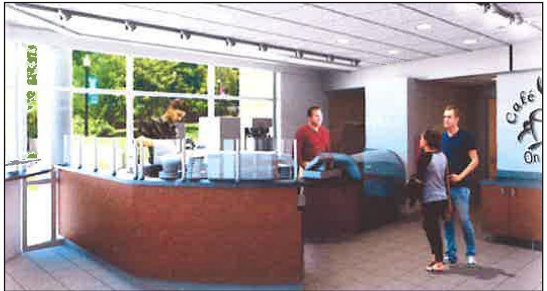
This illustration shows what the Wheaton Public Library's new Café on the Park will look like.

Some other exciting things happening at the library in the past year include a new ongoing used book