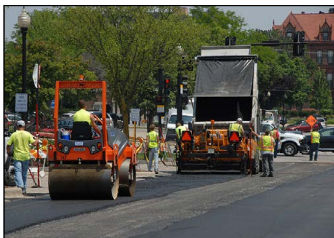
City crews worked to repair portions of the roadways that deteriorated from the extraordinarily harsh winter in 2014.

6,321 Of the 6,321 ash trees that lined Wheaton parkways before the emerald ash borer infested the entire