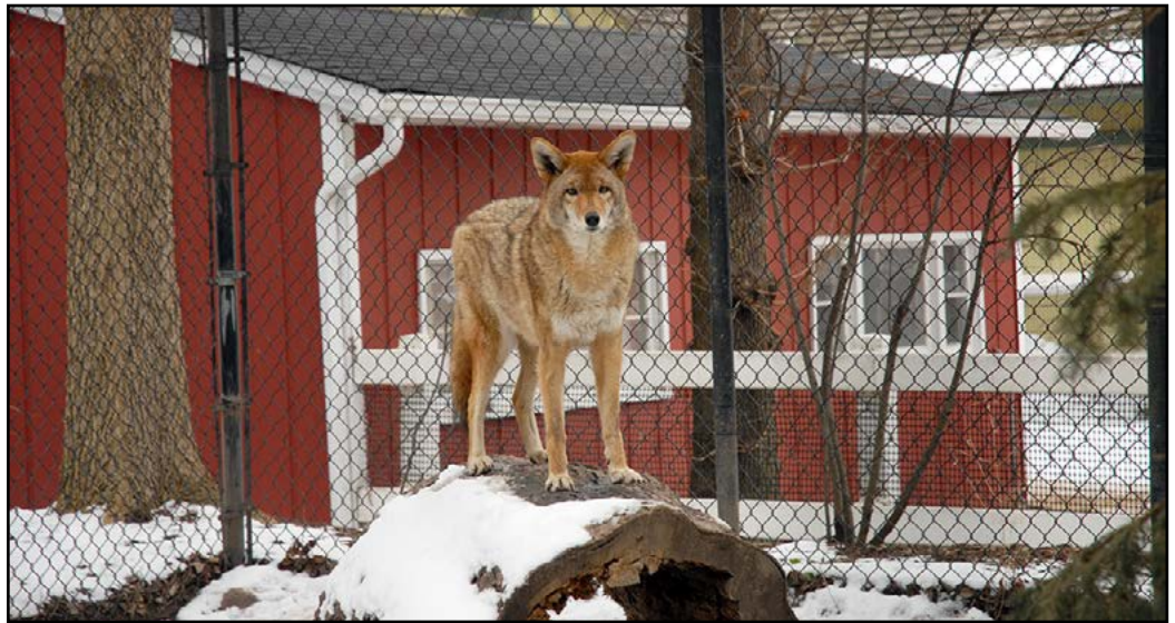
Ensure you are not providing coyotes with a source of food, such as pet food left outdoors.

Other elements of the overall project include an upgraded rail signal system to improve train flow, new cross-overs and a third set of rails in two bottleneck areas.