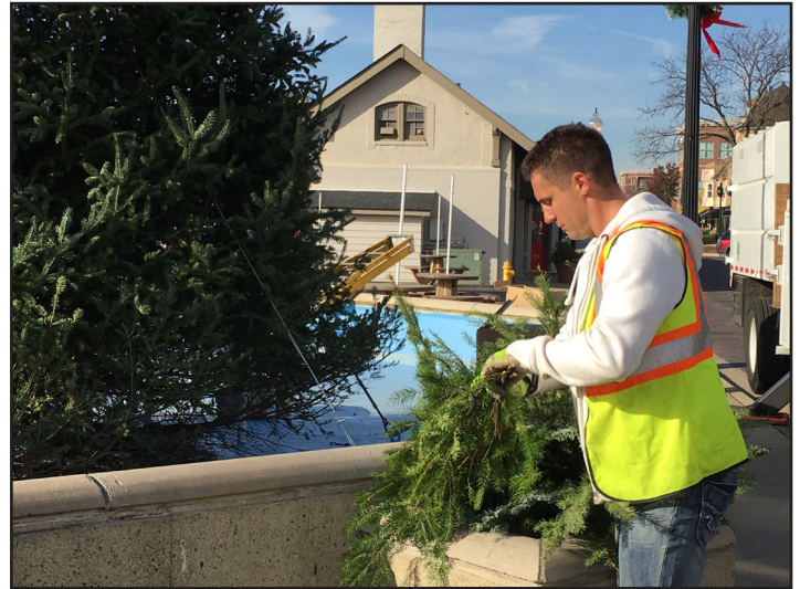
Public Works crews put up the tree in Martin Memorial Plaza, fill planters with greens and much more before the holidays.