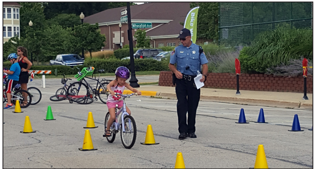
The Wheaton Police Department offers a fun bike rodeo challenge course for kids.