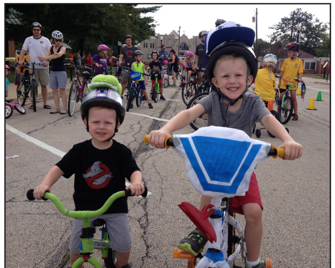
Children can decorate their bikes and participate in a bike parade through downtown Wheaton.

You do not need to register for this event, and it is free to participate.