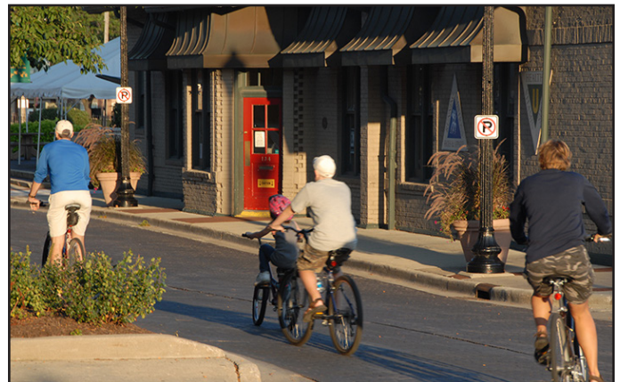
The festival will begin with a bike parade. Participants are encouraged to decorate their bikes.

From 10:45 a.m. to 1 p.m., there will be family activities