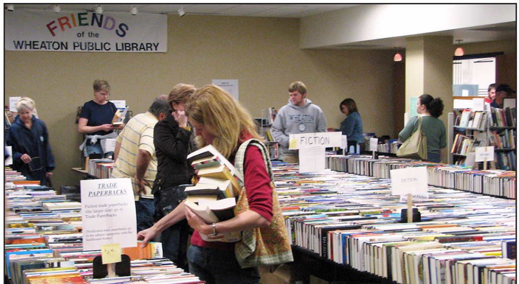
The Friends of the Wheaton Public Library Book Sale will feature more than 20,000 books.

The complete video is available on the City's website , and Wheaton cable subscribers can view it on CWC10.