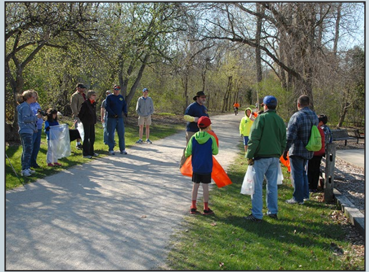
Prairie Path Cleanup: April 30

This Wheaton favorite will kick off its outdoor season on Saturday, April 16. Held in the commuter parking lot near Liberty Drive and Main Street (just south of the railroad tracks), the French Market is an outdoor market selling locally grown produce, flowers, handmade