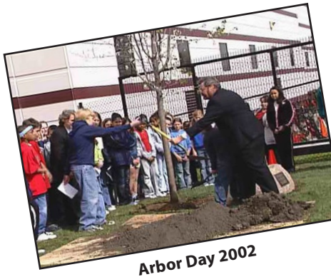
Arbor Day 2002