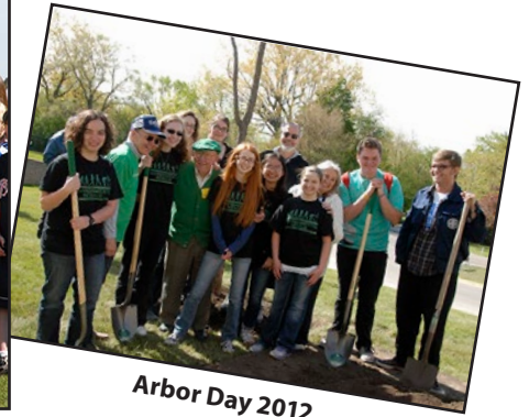
Arbor Day 2012