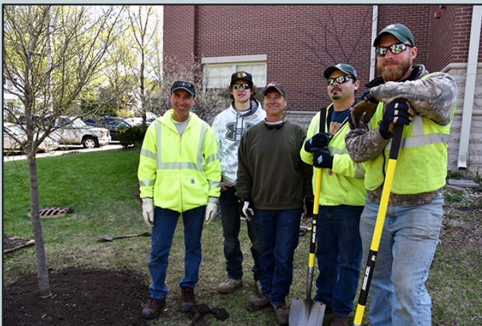
Arbor Day Celebration: April 29

Join in this annual event to clean up the part of the Illinois Prairie Path that runs through Wheaton. See page 4 for more information.