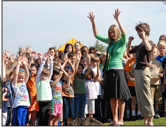
Arbor Day 2009