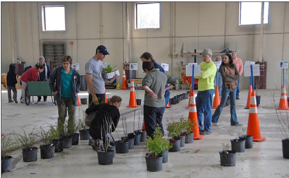
The Native Illinois Plant Sale will take place in the Public Works Building from 8:30 a.m. to noon Saturday, April 26.