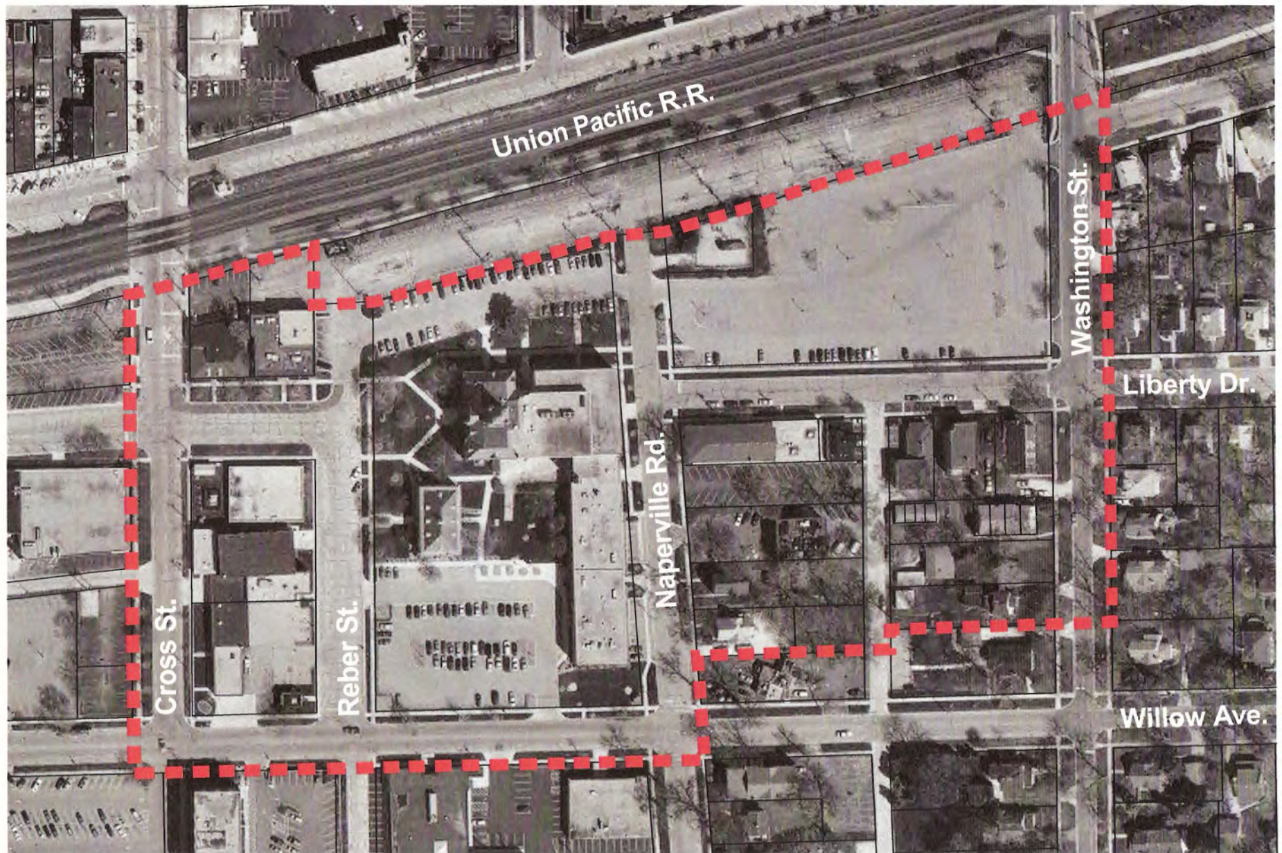
Exhibit 1 - Project Area Boundaries

Courthouse Redevelopment Project Area Plan City of Wheaton, Illinois