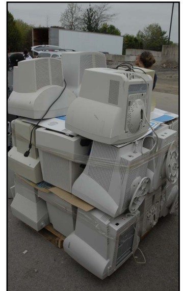
Residents have several other options for electronic recycling, including the curbside pickup program, which is available through the City's garbage hauler.

More information will be posted on the City's website and sent to Email Updates subscribers once details are available. To receive email updates, visit www.wheaton.il.us/emailupdates .