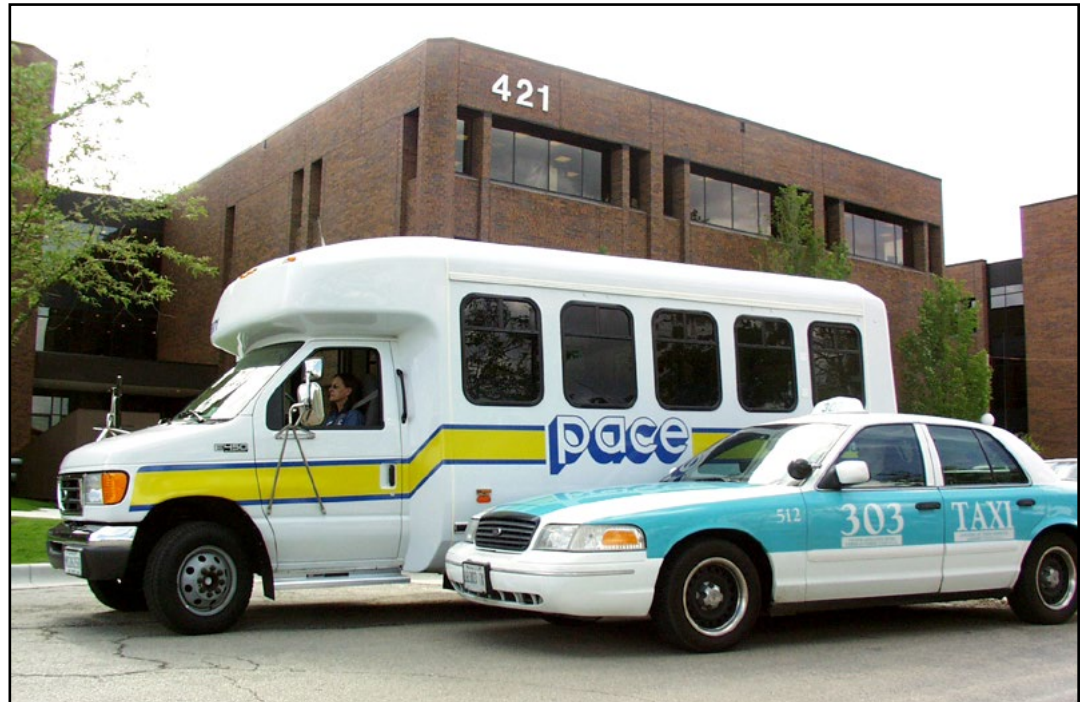
Ride DuPage fares will increase to a flat fee of $2 per ride plus $1 for each mile traveled.

To register, complete a Ride DuPage Registration Form and Waiver (pdf) and send it to the City of Wheaton, Attn: Ride DuPage, 303 W. Wesley St., Wheaton, IL 60187. You can download a Ride