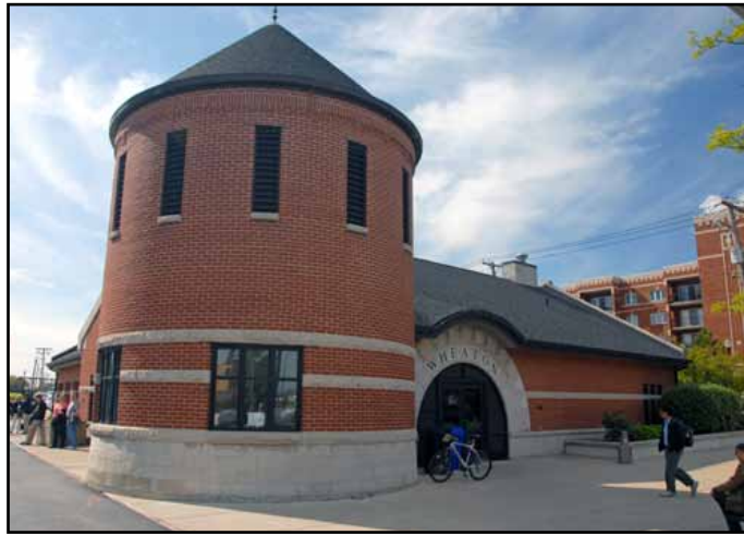
The Chaddick Institute named Wheaton the No. 6 top transit Chicago suburb, in large part because of its top-rated train stations. Below: Money Magazine noted events like Vintage Rides among reasons why Wheaton stands out.

This availability of transportation also earned Wheaton recognition as the sixth top transit suburb in the Chicago area according to a DePaul University study. The Chaddick Institute for Metro-