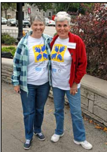
The Community Relations Commission leads Wheaton's Make A Difference Day efforts.

Community encouraged to take part in day of volunteering