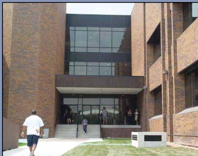
DuPage County Document Shredding Event: Oct. 13

DuPage County will host a free document shredding event for residents (no businesses) from 9 a.m.-noon Oct. 13 at the DuPage County Administration Building, 421 S. County Farm Road. All documents will be shredded on site. Residents are limited to four boxes.