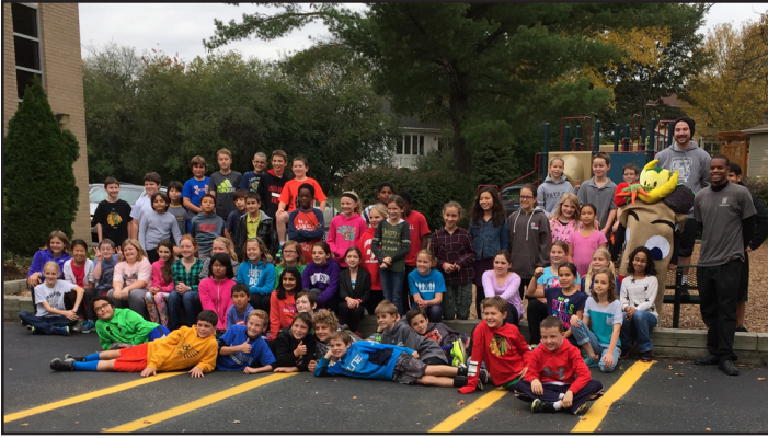
Students from Madison Elementary School (above), Wheaton Warrenville South High School's Key Club (right) and Wiesbrook Elementary School (bottom right) collected food for the Stuff a Truck with Food Drive in 2015.