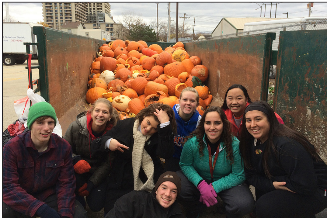
Last year's collection of pumpkins for composting collected 7,220 pounds of pumpkins.