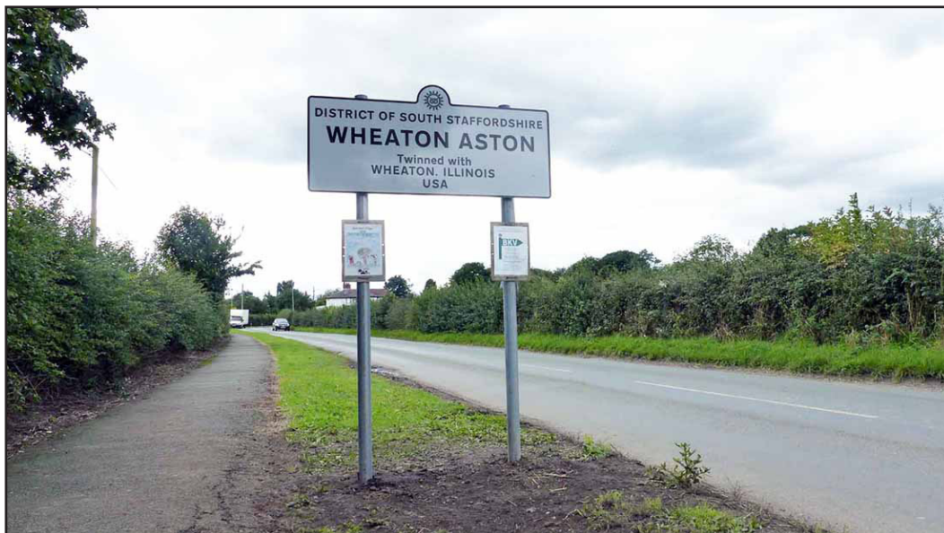
New signs in Wheaton's English sister city celebrate our 25 years of being "twinned."

This year marks the 25th anniversary of Wheaton's sister city relationship with Wheaton Aston, England. Situated in the heart of the English countryside, the village of Wheaton Aston is part of a rural community of about 2,500 residents located approximately 65 miles south of Manchester.