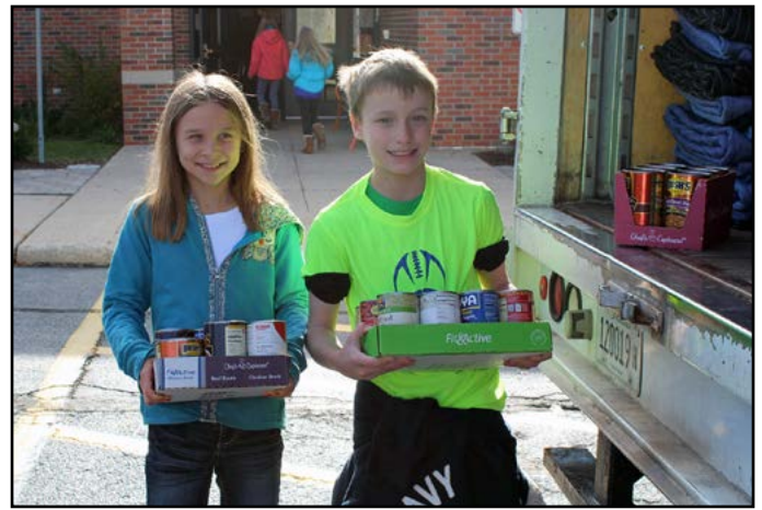
A number of Wheaton schools will be taking part in the Stuff a Truck with Food drive for Make a Difference Day.

The City will provide bags, buckets, extra rakes