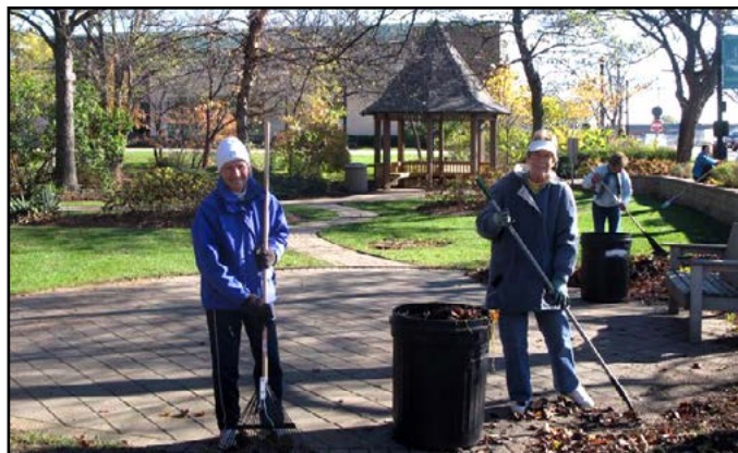
Residents can help with an Adams Park Cleanup project as part of Make a Difference Day on Oct. 25.

The commission also seeks businesses or citizens to help fund 850 workout T-shirts for soldiers in the