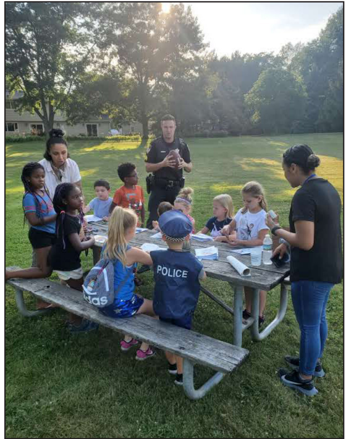
The Wheaton Police Department is excited to extend the roll calls to 16 neighborhoods this summer.