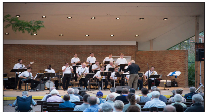
The Band has over 80 members that play every Thursday night at the Bandshell.

School for an antiphonal finale that will not be forgotten. Every Thursday, starting on June 9 through August 4, as weather permits, the Municipal band will hold a concert in the bandshell starting at 7 p.m. The concerts are free, and all are welcome. For a full calendar of their performances, visit www.wheatonmunicipalband.org .