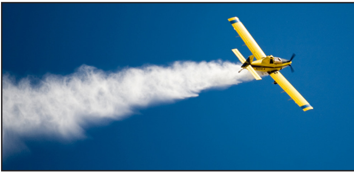
Yellow airplanes will be distributing the aerial spray in late June.