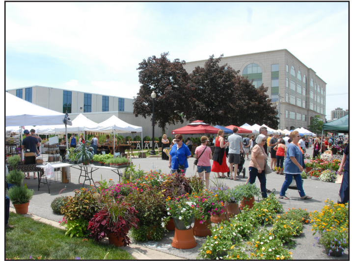
The Wheaton French Market will begin on April 9 in its temporary location on Liberty and Reber Street, in front of the old DuPage County Courthouse in downtown Wheaton.

To apply, fill out an application form .