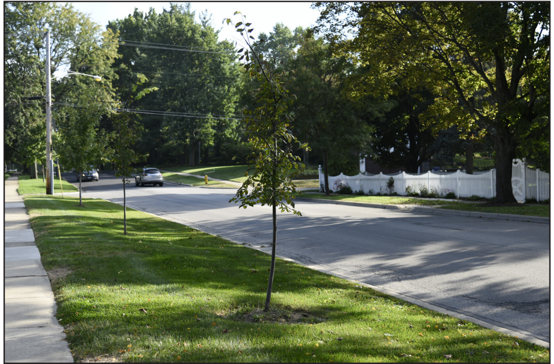
The City offers a choice of 11 types of trees in this year's Shared Cost Parkway Tree Program.

Residents can choose from a variety of native and non-native trees varying in height and size at a cost of $95 per tree as part of the program. All new trees will be approximately 1¾" to