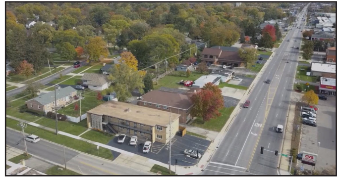
The Roosevelt Road Corridor Plan focuses on the portion of Roosevelt Road from Carlton Avenue to the city's eastern limit.

Now open: Mila Grace Boutique, 217 S. Main St., is a trendy alternative fashion boutique for teens and women, regardless of shape or size. The boutique features predominantly dresses for all occasions and seasons, all year round.