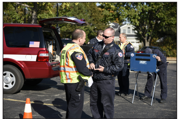
Wheaton Police and Fire Department personnel set up a mobile command post during an active shooter training exercise at Wheaton College on Oct. 19.

"We are fortunate for Wheaton College's help to make this exercise a valuable learning opportunity for our first responders," Schultz said.