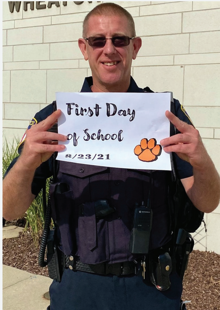
The Wheaton Police Department wishes everyone a safe and successful school year.

designated sidewalks or paths, never along the side of the road.