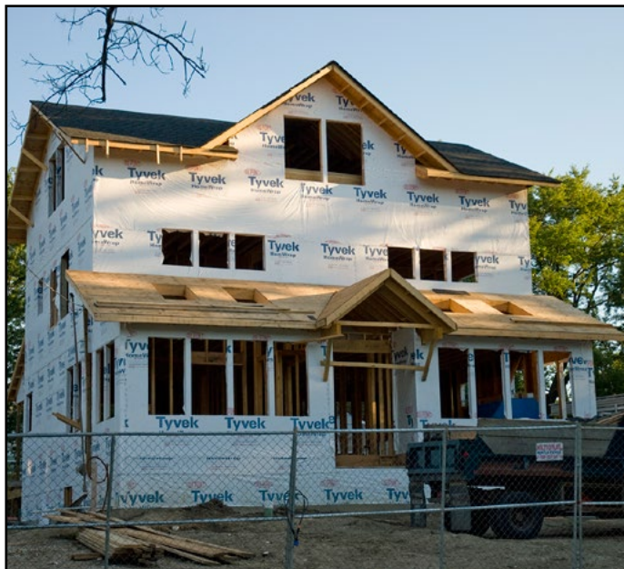
The City currently enforces the 2003 ICC Building Codes but will consider updating to the 2012 ICC Building Codes.

T he City's Building Department is reviewing the 2012 ICC Building Codes for consideration by the City Council in the coming months. The City currently enforces the 2003 ICC Building Codes.