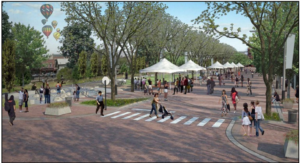
This rendering shows the proposed changes to Liberty Street, including a park.