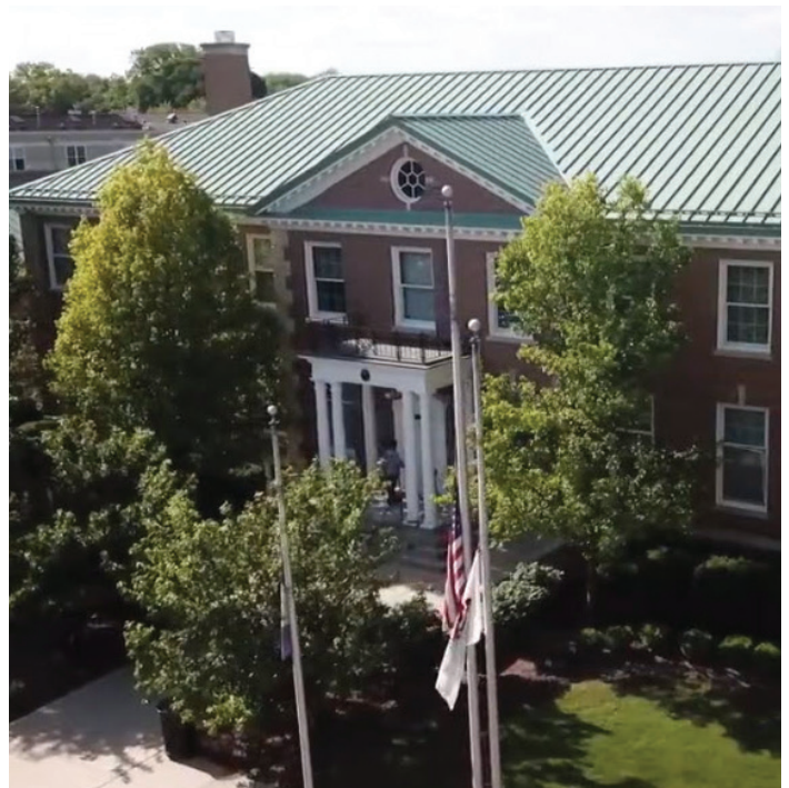
Mayor Suess addressed the Covid-19 pandemic's effect and how the community came together during the State of the City Address.

Mayor Suess addressed the effect of the Covid-19 pandemic on the City but also highlighted the way in which the community came together. Throughout the pandemic, the City and partners supported local businesses by connecting them with federal and state