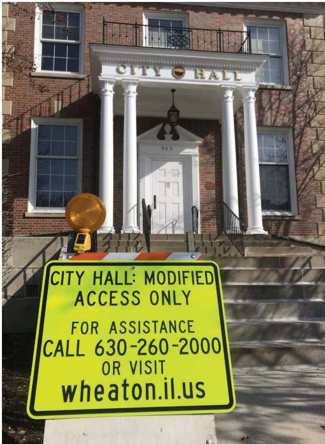
City facilities will have limited access for public to ensure safety of residents and staff.

Furthermore, all library programs, meetings, and events have been cancelled until June 1. Library staff is working on providing the highest quality service and programming to patrons remotely at this time.