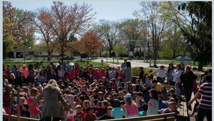
The Arbor Day Celebration and other events have been postponed and/or cancelled due to COVID-19 crisis.

The City anticipates additional events will be postponed and/or cancelled. Updates will be posted at wheaton.il.us/COVID-19 .