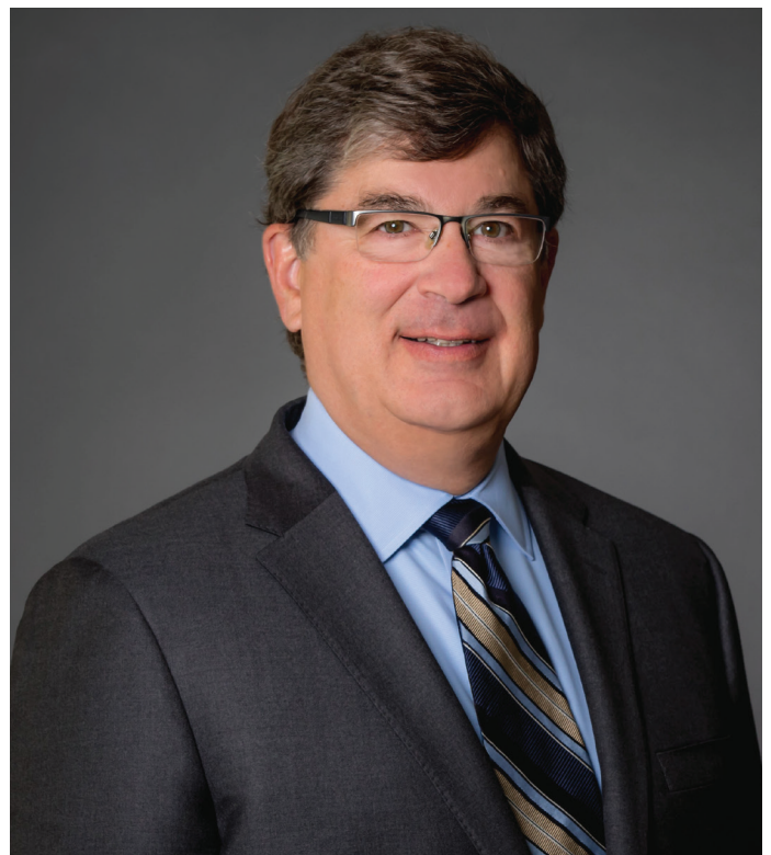
Mayor Suess and the Wheaton City Council approved a local state of emergency declaration.

Declaring a local state of emergency is a tool that cities can use in extraordinary times to make goods and services more readily available. It also allows the City to quickly activate the City's emergency operating plans. Finally, it ensures that Wheaton will be eligible for further