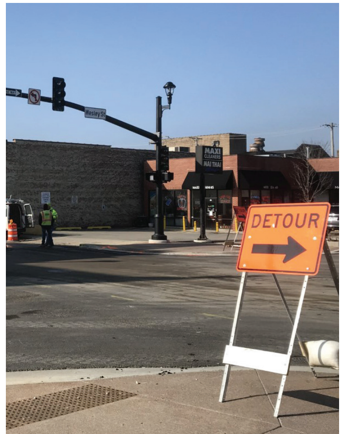
Traffic detour began Thursday, March 26, for the block of Main Street between Front Street.

Thank you for your patience as crews work to make important infrastructure improvements.