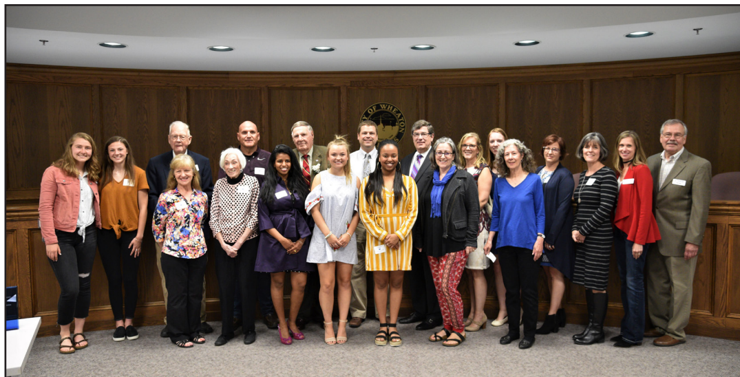
Pictured above are the 2019 recipients of the Good Citizen Awards.

This award helps recognize those who make the generous and often extraordinary contributions that make Wheaton an outstanding community. This may be