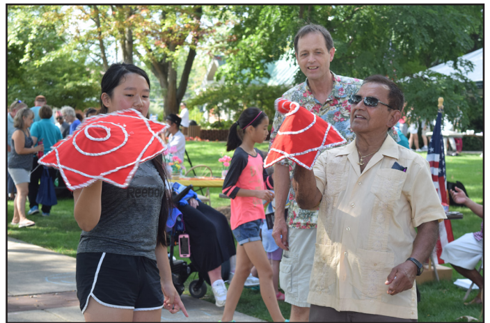
Learn about different heritage and cultures with many interactive displays, art, food and more.

The Community Relations Commission encourages the