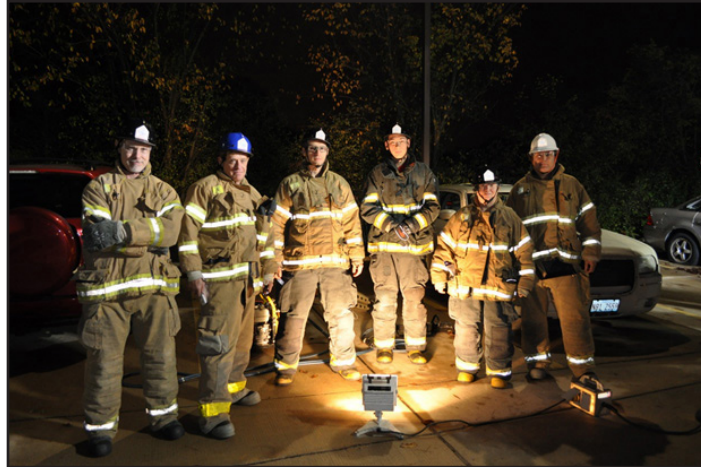
The Citizens Fire Academy teaches many aspects of how the Fire Department operates.

The Citizens Fire Academy is a 7-week course offered exclusively to Wheaton residents. The academy runs from 6:30-9:30 p.m. Tuesdays, Sept. 17 to Oct. 29. The program covers day-to-day fire station