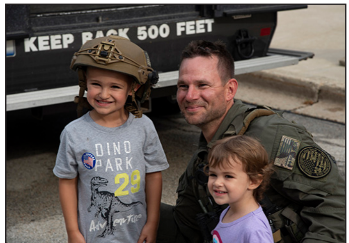
The Wheaton Police Department will host the National Night Out celebration at Northside Park on Aug. 6.