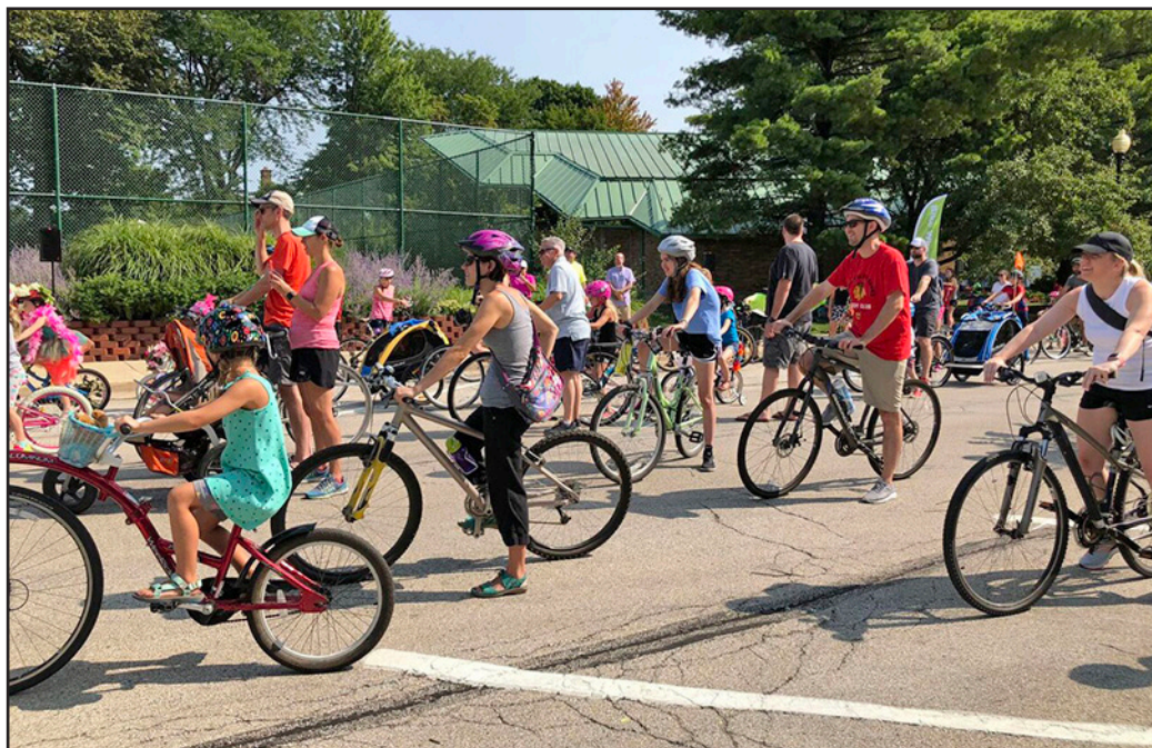
The Bike Wheaton Festival will begin with a bike parade and bike decorating contest.

For information, visit www.wheatonlibrary.org/friends or email friends@wheatonlibrary.org .