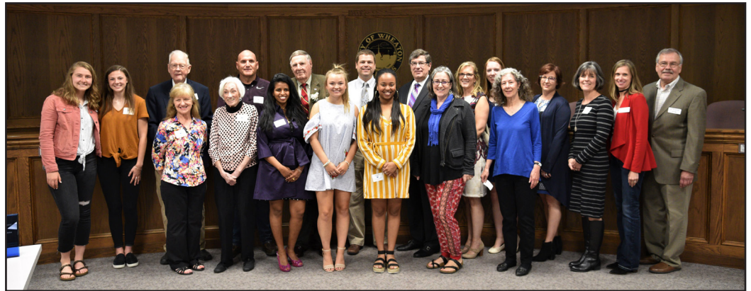
The Community Relations Commission presented the Good Citizens Award to residents in three categories: Group, Student and Adult.

The Wheaton City Council honored this year's recipients of the Good Citizens Award at the May 20, 2019 Council meeting, highlighting some outstanding individuals and groups who have made a difference in the community. The Wheaton Community Relations Commission oversees this annual program, which was developed to recognize residents for their acts of