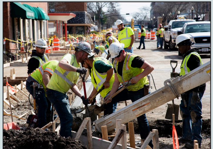
Crews poured new sidewalks on the north side of Wesley and the east side of Cross Street.

Parking reminder: Nearby free parking is available in Lot #2 (off Wesley) and the Wheaton Place Garage (off Front Street).