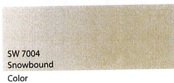
SW 7004 Snowbound Color