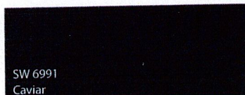
SW 6991 Caviar Color

The digitized image(s) shown approximate actual paint colors as closely as possible. Colors may vary due to viewing equipment, lighting conditions and printers. The Cover The Earth logo and the Sherwin-Williams logo are trademarks owned or licensed by The Sherwin-Williams Company. © 2019 The Sherwin-Williams Company. CMD 19-01-0428 (3/2019)