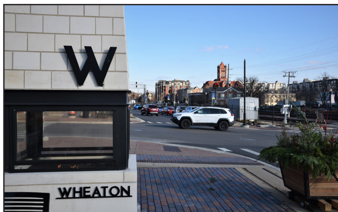
Martin Memorial Plaza features an outdoor fireplace and seating.

Soon after, get a taste for Wheaton's dining options during Restaurant