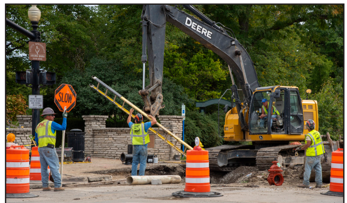
Underground work is happening on Wesley Street as part of the next phase of improvements.

Free parking is always available in the Wheaton Place Garage, 232 W Wesley Street, and Willow Avenue Garage, 220 S Cross Street. For more information on downtown parking, visit www.wheaton.il.us/parking .