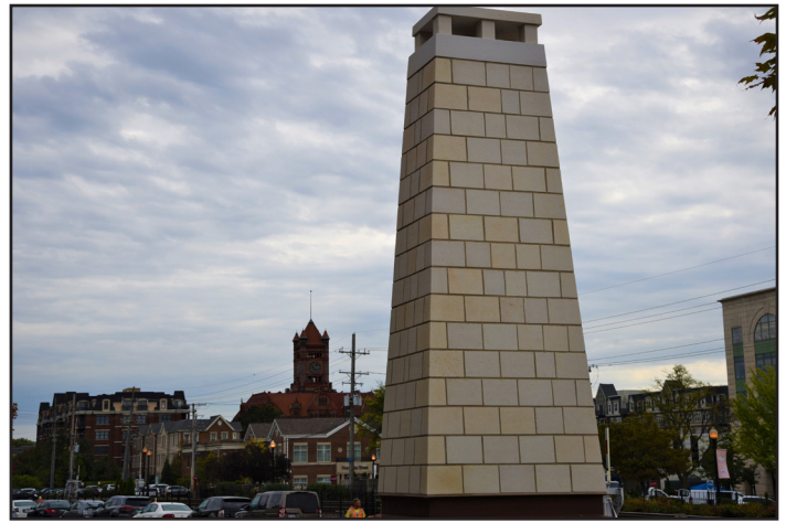
The new Martin Memorial Plaza is taking shape with elements including an outdoor fireplace.