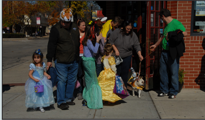
The Boo-Palooza Festival is Saturday, Oct. 27.

Location: Wheaton Public Library, 225 N Cross Street