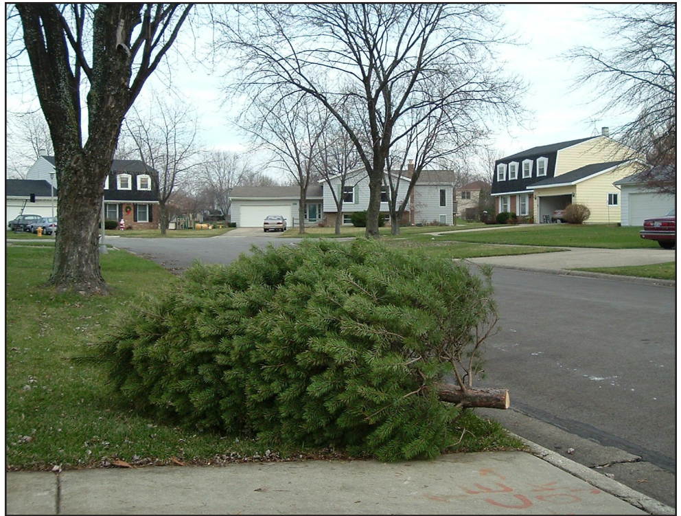
Place your tree at the curb with no decorations, and do not place it in a bag.

Wheaton Public Library is honored to host the World War I and America exhibit throughout the month of January in the library's Arts and Culture Center. This exhibit is part of World War I and America, a two-year national initiative of The Library of America presented in partnership with The Gilder Lehrman Institute of American History, the National World War I Museum and Memorial, and other organizations, with generous support from The National Endowment for the Humanities.