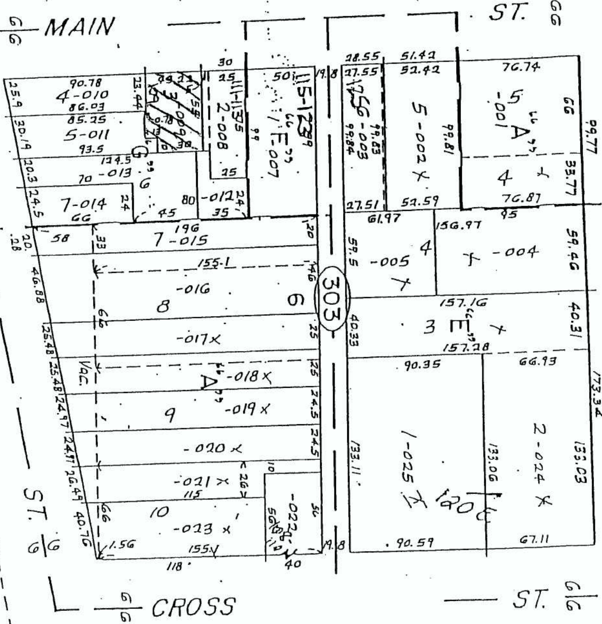
EXHIBIT B to Ordinance (109 North Main Street)