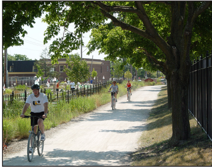
The video gives tips on local riding situations, such as proper Prairie Path rider etiquette.

“As an offshoot of the Wheaton Environmental Improvement Commission, our group is passionate