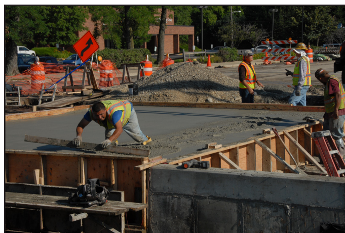
Proposed state cuts would significantly reduce the amount of revenue the City receives for its General Fund, which is used to fund things such as capital projects.

LGDF is State income tax money that has been distributed to local governments since the State income tax was implemented in 1969. To understand the magnitude of this revenue loss on the City's operations, this amount of money represents 65% of the General Fund's capital projects budget, 75% of the General Fund's Public Works personnel costs, 44% of the Fire Department's personnel costs or 23% of the Police Department's person-