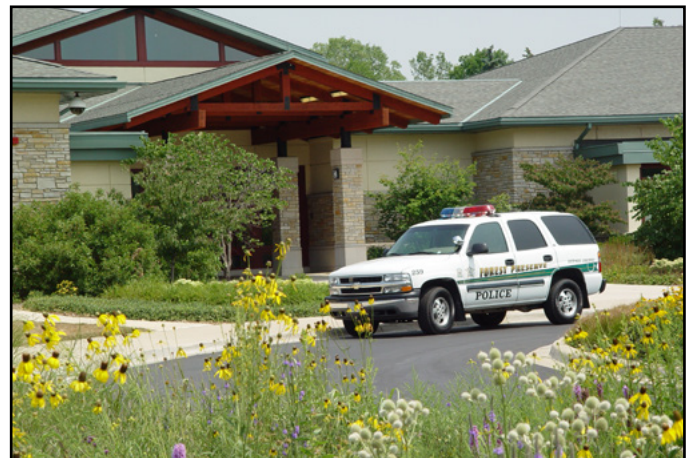
The Forest Preserve District is seeking direction from the public as it develops a large-scale strategic plan.

In addition, the district is hosting community meetings to find out firsthand what residents think about topics such as facilities, programs and restoration projects. A meeting will take place at Wheaton City Hall, 303 W. Wesley St., from 7-9 p.m. Tuesday, May 6.