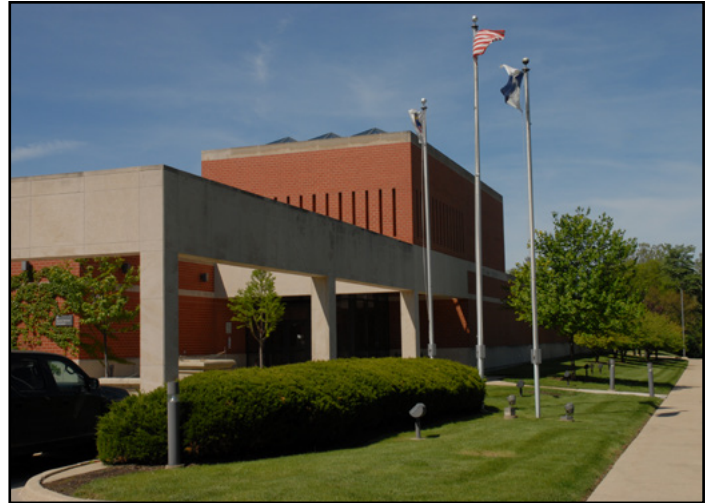
The American Red Cross will operate a blood drive from 9:30 a.m.-2:30 p.m. May 16 at the Wheaton Police Department, 900 W. Liberty Drive. The community is encouraged to participate.

The American Red Cross will be operating the drive. To make an appointment, visit www.red-crossblood.org and enter zip code 60187 in the "Find a Blood Drive" search window. You can also make an appointment by contacting Sherry at 630-260-4861 or police@wheaton.il.us . Appointments are preferred, but walk-ins are welcome.