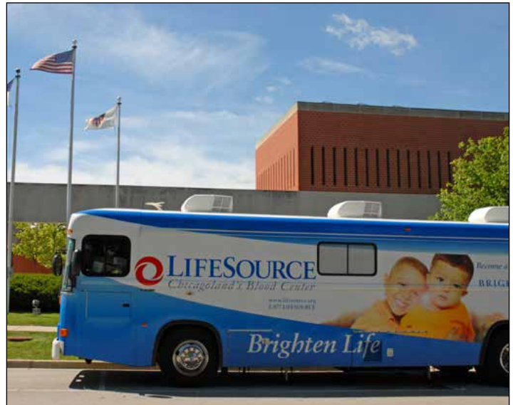
The Wheaton Police and Fire departments encourage residents to donate blood May 17 at a blood drive as part of National Law Enforcement Week.