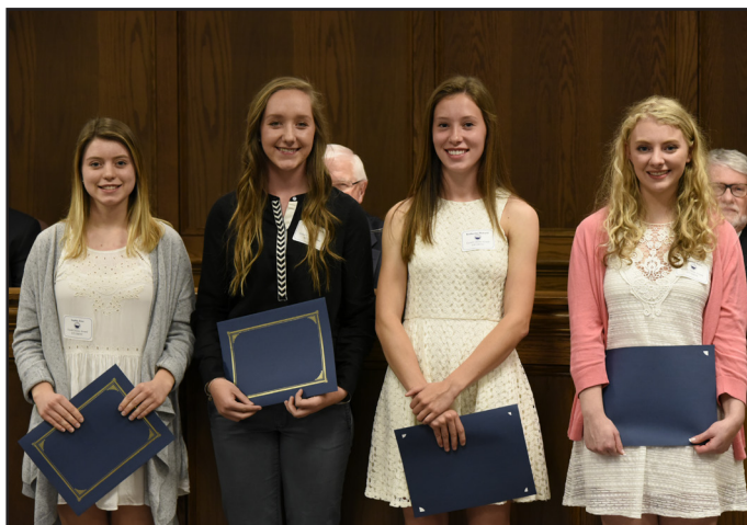
Above are the recipients of the 2016 Good Citizens Award in the student category.

The categories for nominees are: high school