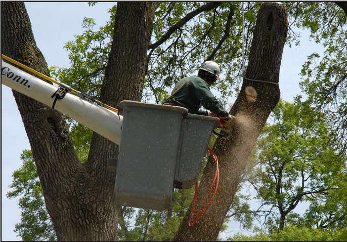
Less than 380 parkway ash trees remain in Wheaton. Before the emerald ash borer infestation, there were 6,321.

What started out as 6,321 ash trees lining Wheaton parkways is down to less 380 trees.