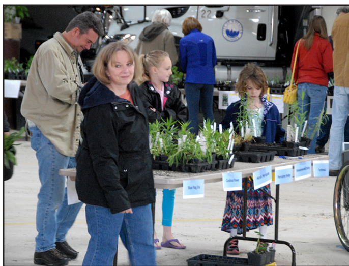
25, 2015 Native Plant Sale.

The Wheaton Environmental Improvement Commission and Wheaton Park District are seeking photos of native plants growing in your yard that were purchased at a past Wheaton Native Plant Sale. The photos will be showcased at the next sale to help attendees see what the various plants look like in a natural setting. The person who submits the best photo will receive a certificate for free plants to use at the April