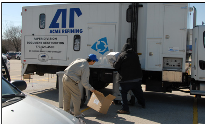
On-site shredding will also take place at the April 12 Recycling Extravaganza in the commuter parking lot at Carlton & Liberty.

Any group wanting to clean a specific area should e-mail cleanupthepath@yahoo.com ahead of time.