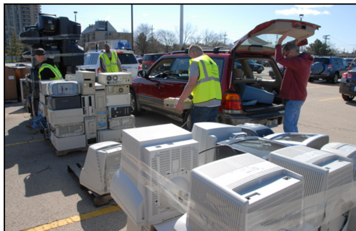
The Recycling Extravaganza will accept many types of electronics, scrap metal and much more