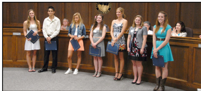
Seven high school students received 2013 Good Citizen Awards and were honored during a City Council meeting.

Do you know someone who deserves to be recognized for their service in the