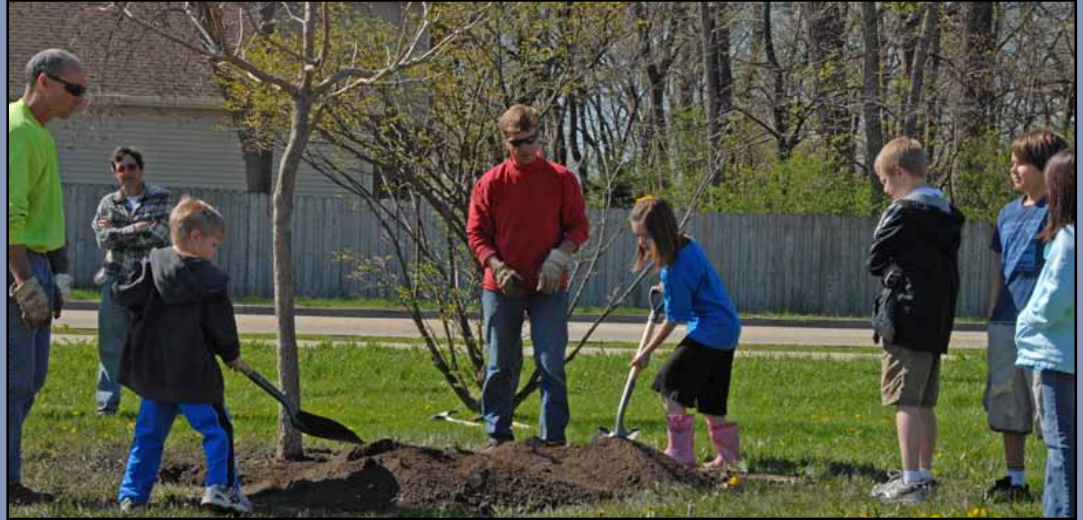
Sandburg Elementary School hosted the 2011 Arbor Day Celebration. This year's event will take place April 27. More information will be posted on the City's website closer to the event.

• Native Illinois Plant Sale: April 28, 8:30 a.m.-noon, Wheaton Public Works Building, 821 W. Liberty Drive. Purchase native trees, shrubs, grasses and flowers; pick up