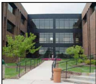
The Early Voting site in Wheaton is at the DuPage County Election Commission Office.

The General Primary Election to nominate federal, state and county candidates by an established party will take place on March 20, 2012.