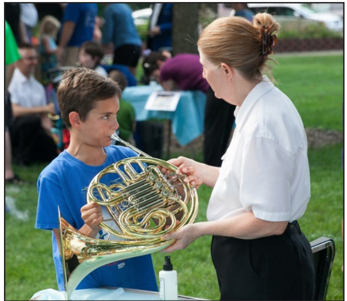
The June 22 concert will include an instrument petting zoo for kids, where they can try out musical instruments.

The concert June 22 will be a "Circus Days" children's concert, with an instrument petting zoo, jugglers, and more fun. See all of the concert themes on the Wheaton Municipal Band's website at http://www.wheatonmunicipalband.org/concerts.html .