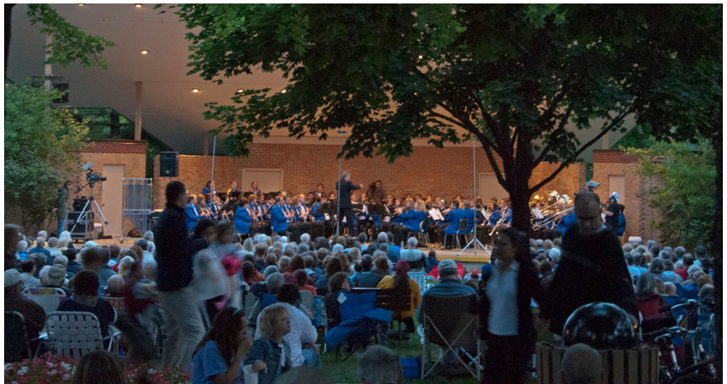
The Wheaton Municipal Band will kick off its season on June 8 in Memorial Park.