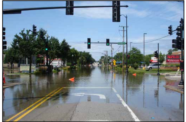
This project will help reduce the incidence of flooding on North Main Street near Cole Avenue.

The City will provide construction updates throughout the project via the City's website at www.wheaton.il.us .