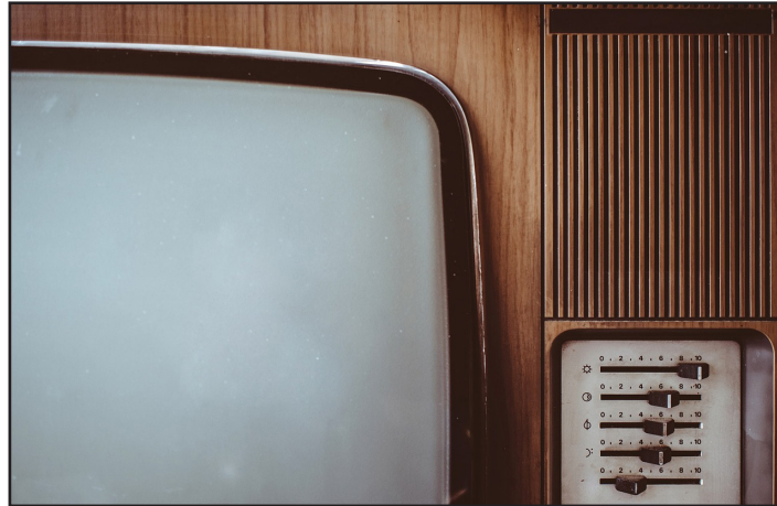
Have an old TV you want to get rid of? The monthly collection will now charge a fee for recycling TVs and monitors.

The biggest change to this program will be a charge for recycling TVs and monitors. TVs/monitors with screens less than 21 inches will cost $25 per item to recycle, and those with screens 21 inches or more will cost $35 per item to recycle. eWorks Electronic